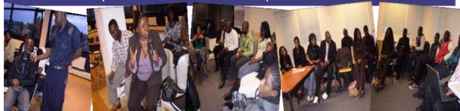
Youth discussion events Education and Health