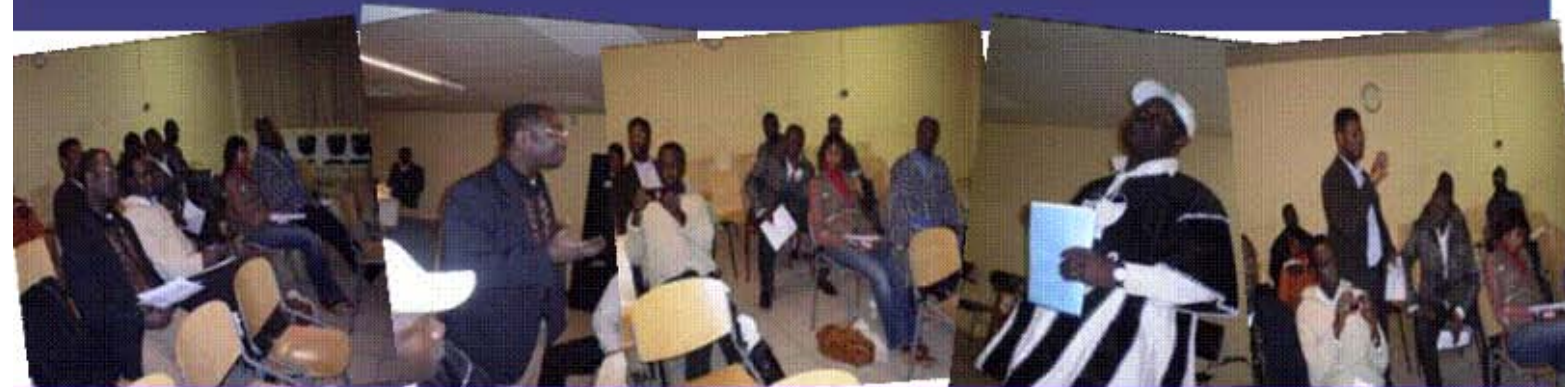
M&D workshop in Amsterdam Workshop: Remittances and Development 7th Februari 2009