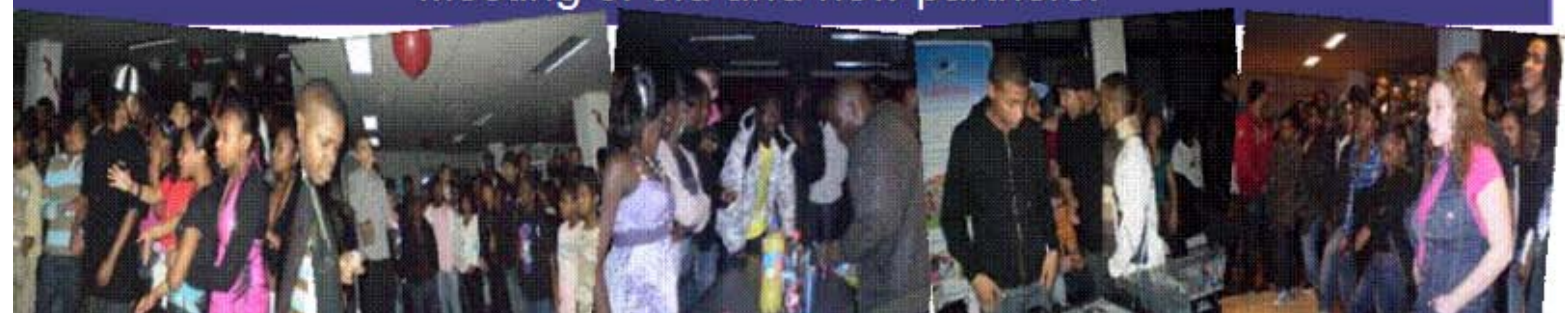
Youth Entertainment End of year youth Gala, Information and award

AfroEuro Foundation, Lsingstraat 108, 2522 KC The Hague The Netherlands, Tel: +31(0)618 126 917, Fax: +31(0)70 399 3423